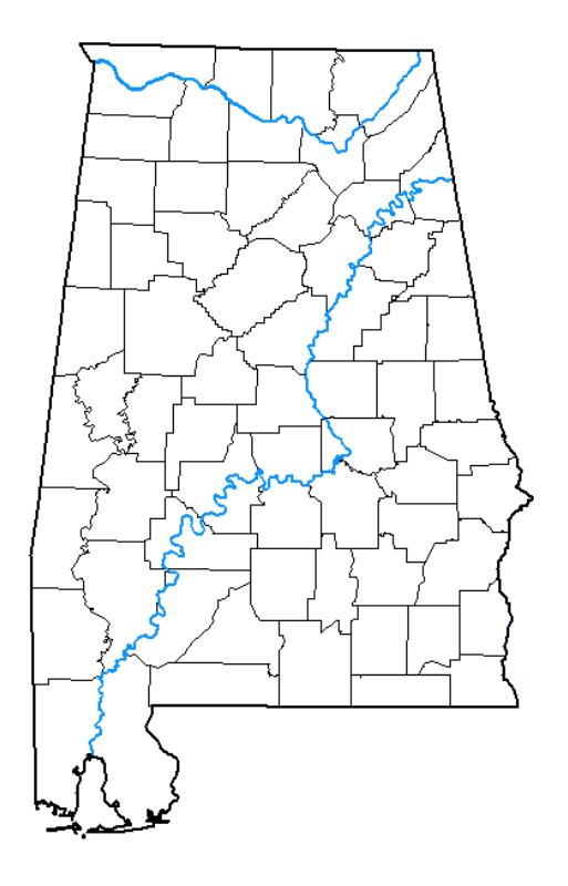
U.S. Drought Monitor Alabama